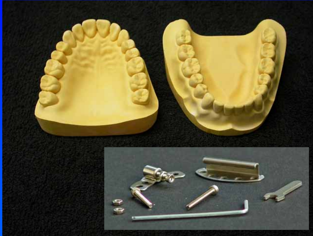
Master models with stainless steel made attachments to adjust the lower jaw advancement. Incl. adjusting screws, counternut to fix protrusion, socket screw key, counternut key