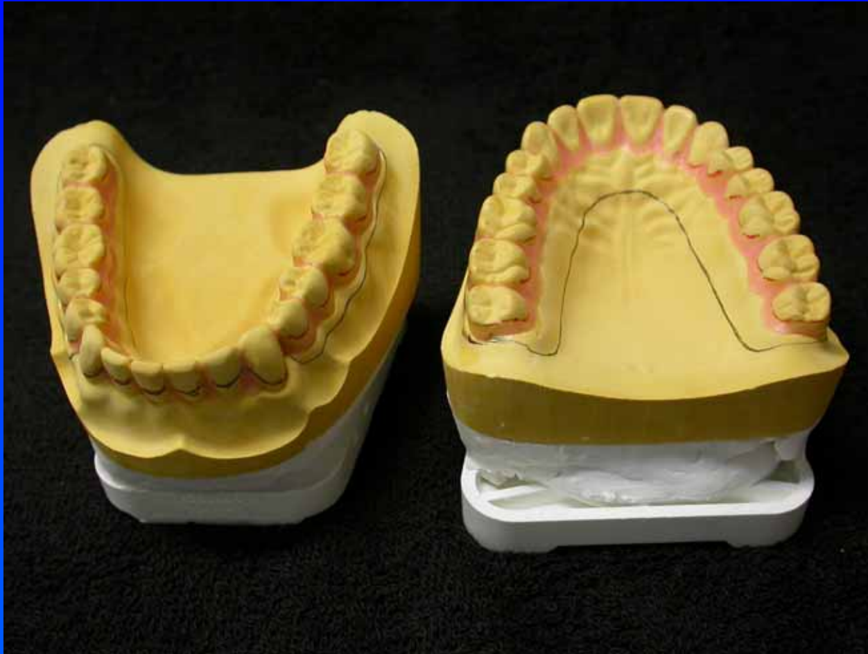
Models with blocked-out undercuts prepared for duplication.