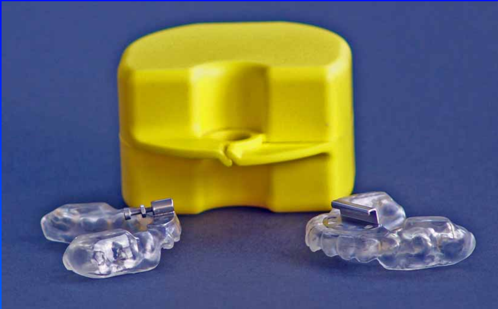
Mandibular adjustable positioner SomnoGuard AP Pro with storage case. The protrusion can be fixed with a counter nut.