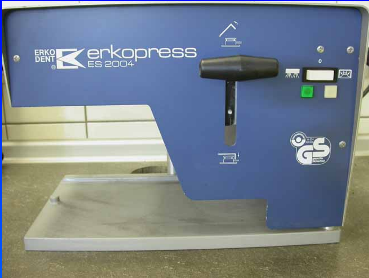
Thermofforming machine, e.g. Erkopress/Erkodent GmbH