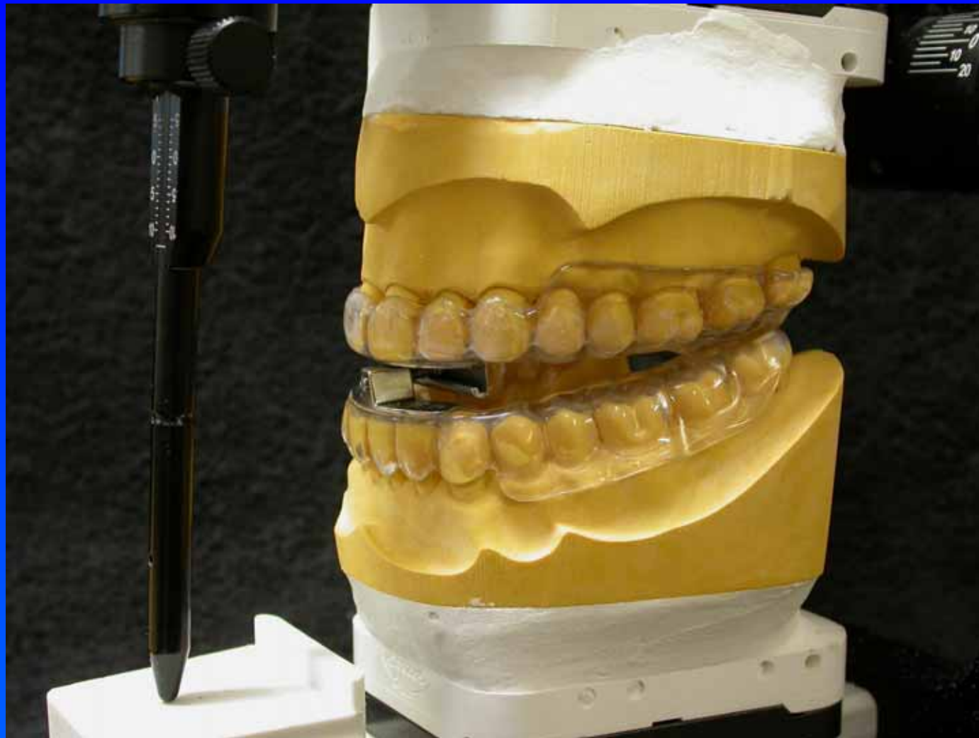
Finished appliances in the articulator.