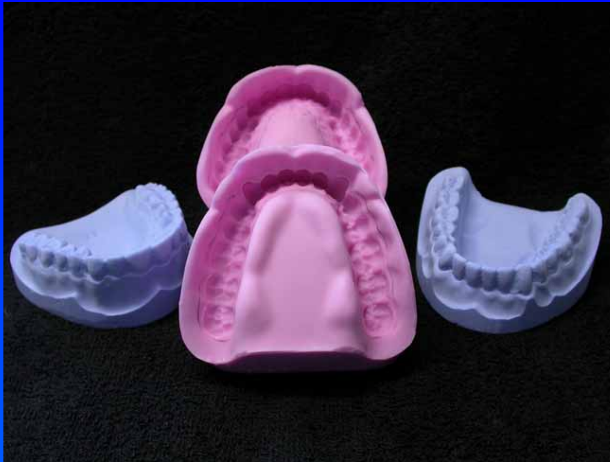
Duplicated forms (pink) and duplicated models (blue)